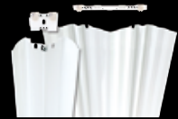
Phoenix Retrofit Series